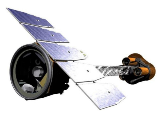
Fig. 1. Mechanical drawing of IXPE on-orbit.